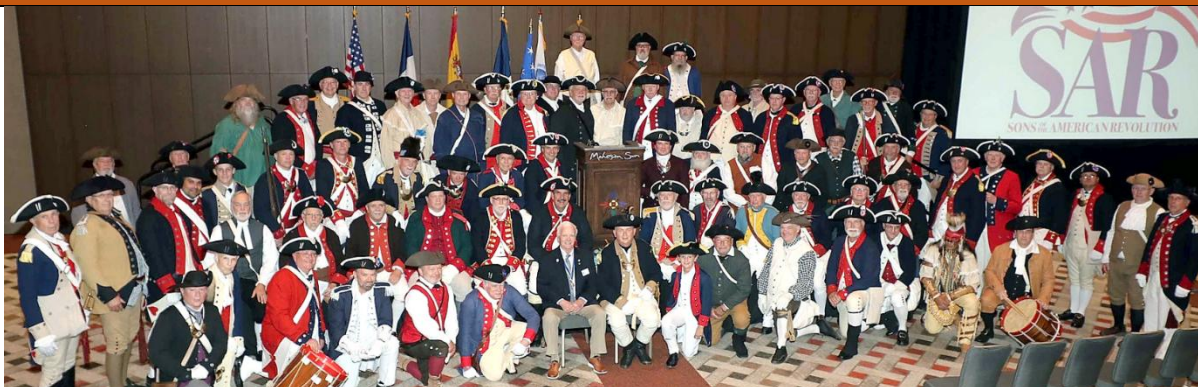
National Color Guard 135th Annual Congress, Uncasville, CT